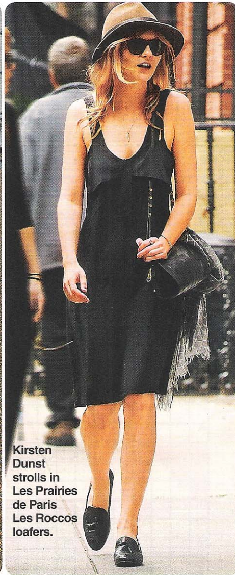
Kirsten Dunst strolls in Les Prairies de Paris Les Roccas loafers.