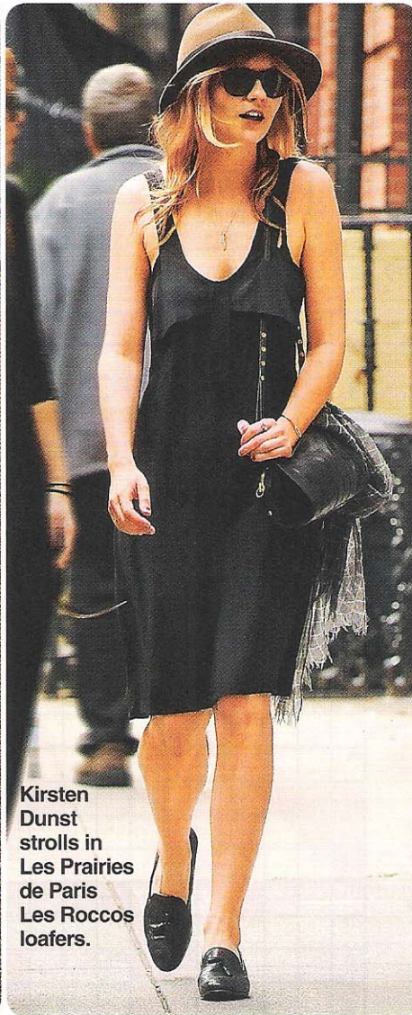
Kirsten Dunst strolls in Les Prairies de Paris Les Roccas loafers.