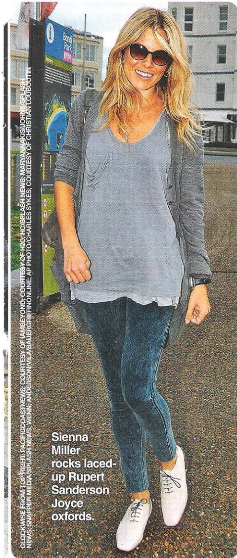
Sienna Miller rocks faced-up Rupert Sanderson Joyce oxfords.