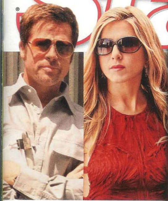
Brad & Jen TOGETHER IN L.A.! ANGIE FUMES IN N.Y.!